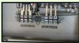
Better esthetic look & easy to maintenance to use of Bus-bar