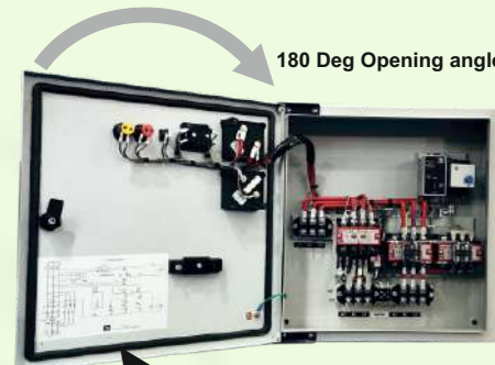
180 Deg Opening angle